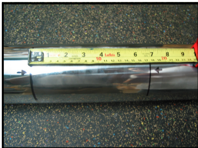
4" Exhaust Only