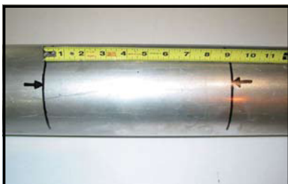
5" Exhaust Only

Select a location that has a minimum of 12" of straight pipe and has sufficient clearance for installation and servicing of the exhaust brake. This location should be as close to the turbocharger as possible and away from dirt and road spray. A 7" section of exhaust pipe needs to be removed. Measured and mark the pipe for cutting.